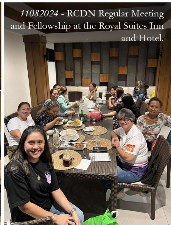
11082024 - RCDN Regular Meeting and Fellowship at the Royal Suites Inn and Hotel.