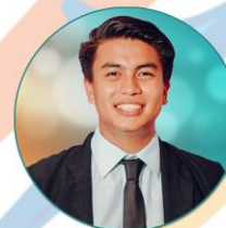
ACE TIMTIM Club Young Leader's Contact / Sgt. at Arms